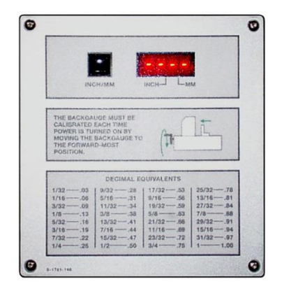
Figure 7 – Display at power up

The backgauge is used to position paper to the desired location when cutting. The backgauge is operated by the hand crank at the front of the machine. The backgauge position is shown by a lighted LED display. When the machine is first powered up, the display shows four lines as follows, indicating the display needs to be reset.