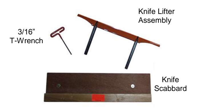
Figure 11 – Spartan 185 Knife Change Accessories

The knife changing equipment shown in Figure 11 is included with the machine. The following instructions show how to remove and install a new or re-sharpened knife. Read through these instructions AT LEAST ONCE before attempting to actually change or install any blades.