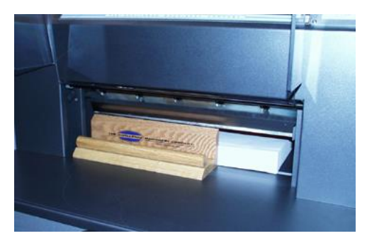
Figure 9 – Jogging Aid

To use, load the paper against the side and backgauge using the jogging aid. Remove the jogging aid from the table, close the shield, clamp the paper, and make the cut.