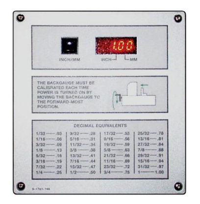
Figure 8 – Display with backgauge at 1.00 inches

To reset the display, bring the backgauge to the forward most position. If the backgauge is already at the forward most position, move the backgauge back by a few turns, then bring it forward again. Now the display should show the actual position of the backgauge (Figure 8). The position of the decimal point indicates whether the reading is in inches or millimeters. Two digits to the right of decimal indicates inches, one digit to the right of decimal indicates millimeters. To switch from inches to mm and vice versa, press the inch/mm button located next to the display.